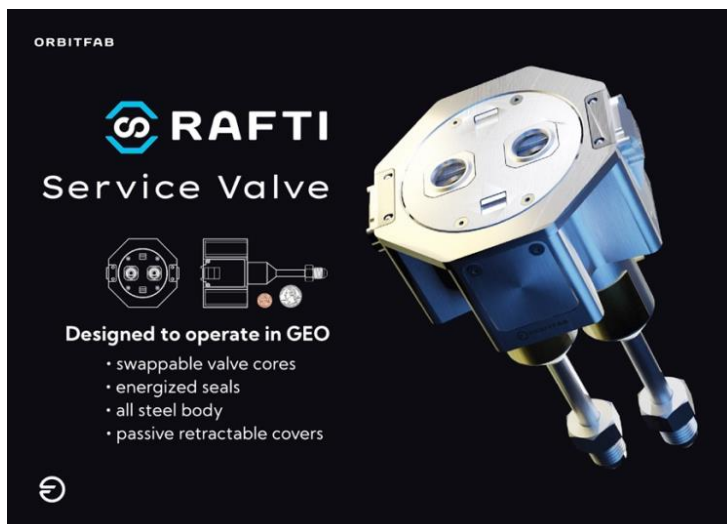
Image 1: RAFTI Service Valve is designed for satellites with a mass up to several tons. It is a fully mechanical valve system with triple-seals, intended for 15 years operation in LEO and GEO and hundreds of fueling cycles. Read our spec sheet at orbitfab.com/raftib2

https://www.dropbox.com/sh/incsv7hwd3j8tnk/AAB_sGHKIP-EsMIVLtFAXzDxa?dl=0