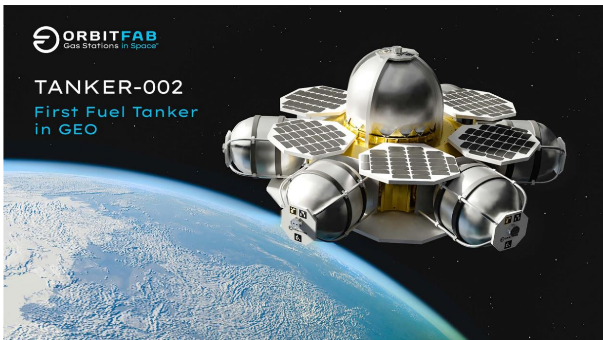
Image 3: Design concept for Orbit Fab's Tanker-002, mounted on a Spaceflight Sherpa-ES in transit to geostationary orbit.